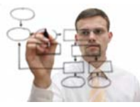
Project Management Offices