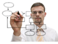
Project Management Offices